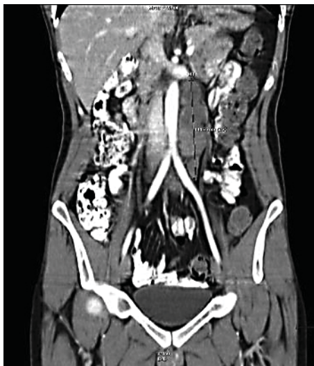
Fig. 2. Abdominal CT scan showing a retroperitoneal mass on the left side of the aorta compressing the left renal vein.