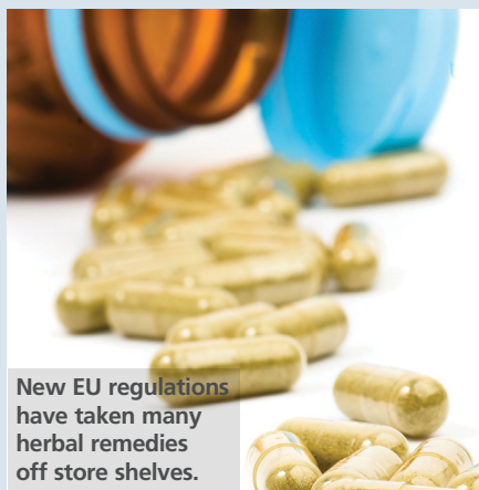
New EU regulations have taken many herbal remedies off store shelves.

BREATHE LA, a nonprofit environmental public health advocacy organization, recently renewed its O24u environmental education and asthma management program in the city of Long Beach. 4 More than 21% of the children in this port city have asthma. The O24u program trains facilitators in 36 Long Beach elementary schools to educate children and their parents about air pollution causes, effects, and asthma identification and management. BREATHE LA estimates the project could yield a 10–15% decrease in school absenteeism due to asthma and a $2.7 million savings in avoided asthma-related emergency room visits and hospitalizations.