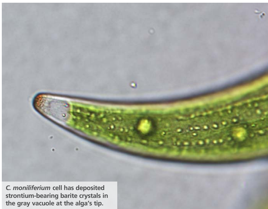
C. moniliferum cell has deposited strontium-bearing barite crystals in the gray vacuole at the alga's tip.