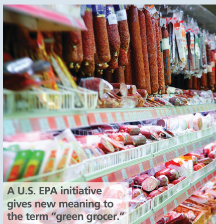
A U.S. EPA initiative gives new meaning to the term “green grocer.”

Since 2007 food retailers participating in the U.S. EPA’s GreenChill partnership have voluntarily agreed to adopt refrigeration