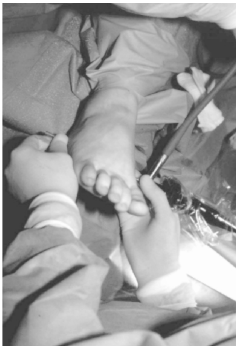
Figure 1. Intraoperative photograph of instrumentation in place.