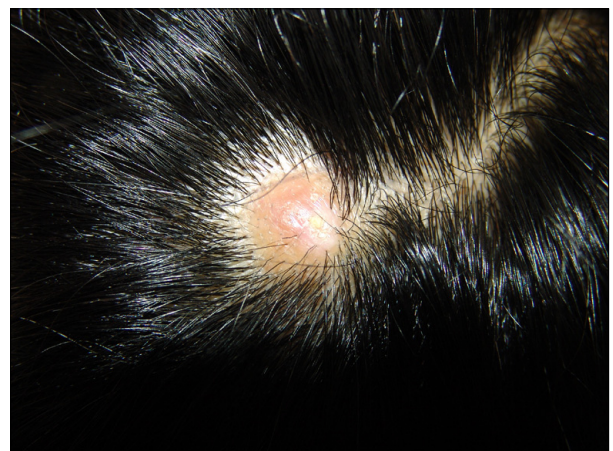
Fig. 1. A solitary, well-defined, erythematous, hairless nodule with a hyperkeratotic plug on the left parietal scalp.

The dermatologic examination revealed a 1.2×1.0 cm sized, erythematous, hairless nodule with a yellowish hyperkeratotic plug on the left parietal scalp (Fig. 1). On histologic examination, there were two large cup-shaped