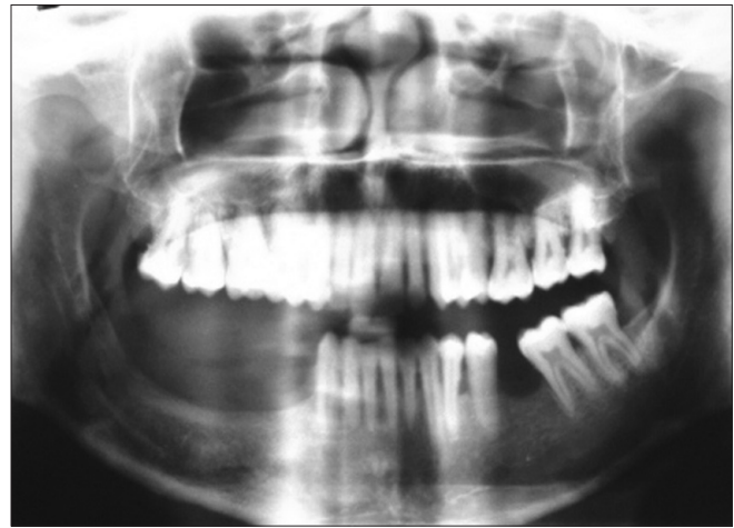
Figure 3: Postoperative panoramic radiograph, 1 year after curettage, showing no recurrence

The radiological features of ABC in the jaws are quite conflicting; the bone is expanded, appears cystic resembling a honeycomb or soap bubble and is eccentrically ballooned. There may be destruction or perforation of the cortex and a periosteal reaction may be evident. [6] It may appear radiolucent, radiopaque or mixed. In our case, a unilocular