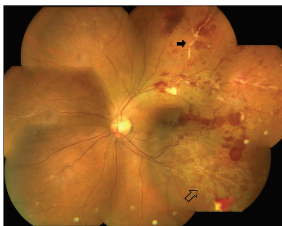
Figure 3: Color fundus montage showing vascular sheathing (solid arrow) and previous sectoral laser marks (blank arrow)