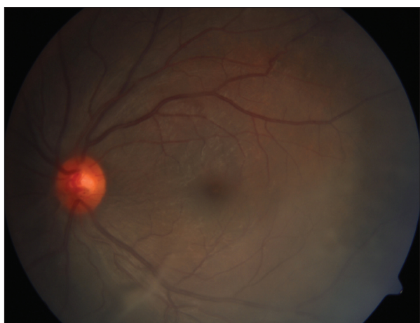
Figure 1: Color fundus photograph showing normal posterior pole with resolving vitreous hemorrhage inferiorly