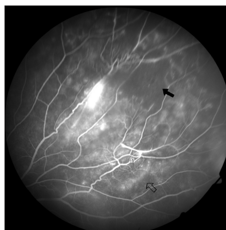
Figure 4: Fluorescein angiogram of patient in figure 3 showing peripheral capillary nonperfusion area (solid arrow) and collateral vessels (blank arrow)