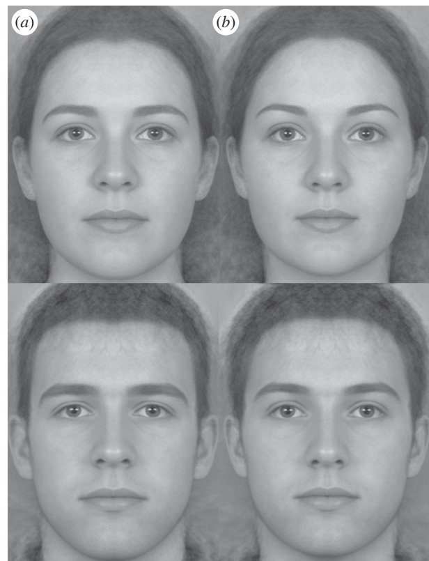
Figure 3. Masculinity/femininity in faces. (a) Male and female composite images made more masculine and (b) more feminine. Masculinity is transformed using the difference between male and female face shape as defined by creating a male and female composite. Preferences for masculinity in male faces vary across studies, but feminine female faces are consistently found more attractive than masculine female faces.

Japanese male face continua. Similarly, Japanese participants also selected significantly feminized versions of the male stimuli for both the Japanese and Caucasian male face continua. Thus, in both cultures it was found that participants showed a preference for feminized male faces. Since then, several studies have also documented preferences for femininity [62,90,92,93], but some similar computer graphic studies have also reported preferences for masculinity [94,95]. Although some of this variation may be attributed to other characteristics of the faces that varied between sets of stimuli [96], this does not explain the variability in preferences. We discuss the sources of individual differences in preferences for sexually dimorphic shape cues in the latter sections of our article.