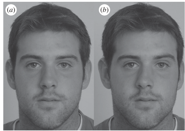
Figure 1. Symmetry and asymmetry. (a) A shape-symmetric facial composite and (b) asymmetric version. Features and outline are marked on the faces in order to create symmetric/asymmetric versions. The asymmetric version has had its asymmetry enhanced by 50%. Symmetric images are usually preferred to asymmetric images.

Importantly, recent studies have implicated perceptions of health in attraction to symmetric faces [44,53]