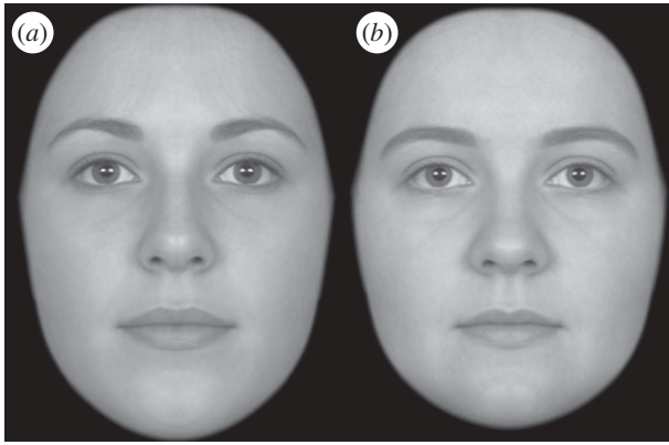
Figure 4. Facial healthiness. (a) Composite images of 15 women rated as high on healthiness and (b) 15 women rated as low on healthiness. High healthiness is associated with higher ratings of attractiveness.

there is a large and obvious selective advantage in detecting healthy partners both for social exchange and mate choice. Indeed, while the role of health in mate preferences is clear (see below), recent work has demonstrated that participants are more willing to reciprocate trust from healthy-looking social partners than from social partners who are relatively unhealthy-looking [98]. Such findings demonstrate the importance of health perceptions for social interaction generally. Again, as for previous traits, there may be both direct and indirect benefits to partnering with individuals who are perceived to be healthy.