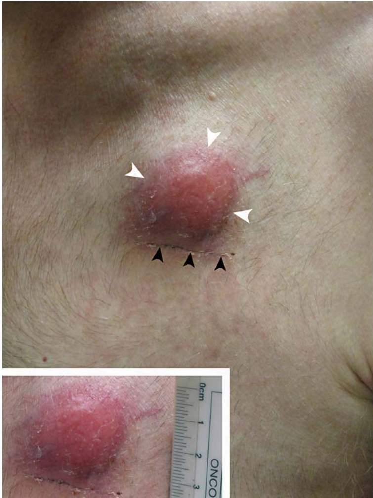
Fig. 2. Photograph of the patient's chest reveals a subcutaneous mass (demarcated by white arrowheads) with overlying erythema located at the skin entry site of the previously tunneled central venous catheter. Note the healing incision from the subsequent open biopsy (demarcated by black arrowheads). Inset shows that the nodule measures 2 × 2 cm.