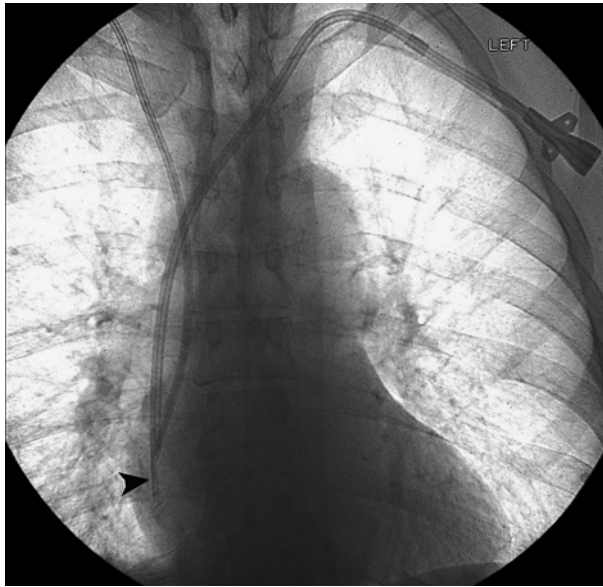
Fig. 1. Fluoroscopic spot image after tunneled central venous catheter insertion for stem cell therapy shows the newly placed left-sided triple-lumen catheter with the tip (arrowhead) appropriately positioned in the upper right atrium. Note that a right-sided central venous catheter was also present.