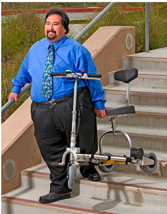
Figure 3. Photo from an online brochure for a battery-powered mobility scooter.

Americans living longer and functioning in the community (Preston, 2005) or that broader medication for hypertension and cholesterol might avert a decline in life expectancy (Cutler, Glaeser, & Rosen, 2007). Even the optimistic scenarios suggest an increasing prevalence of the threats to cognitive function reviewed here. Projected growth in the population of diabetics is one sign of the problems to come. The aging of the baby boom generation, combined with the body mass trends, implies that the number of diabetics will increase by 86% in the next 25 years (Huang, Basu, O'Grady, & Capretta, 2009). Similar increases in metabolic syndrome and decreases in vascular and respiratory fitness seem plausible.