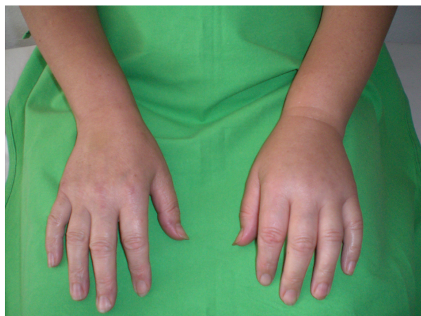
Figure 1 Subcutaneous edema on the left hand of a patient with HAE-C1-INH.

As HAE is a hereditary disorder, gene therapy would be the optimal and definite solution; however, it is not yet available.