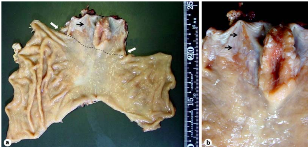
Fig. 2. a Gross image of the resected sample. The tumor was mostly localized proximally to the esophagogastric junction and the cardiac notch, which is presumptively depicted by the broken line and the white arrows, respectively. b Close-up image around the esophagogastric junction. As seen in endoscopy, short-segment Barrett's epithelium was observed near the tumor (black arrows), with intestinal metaplasia and submucosal esophageal glands histologically confirmed.