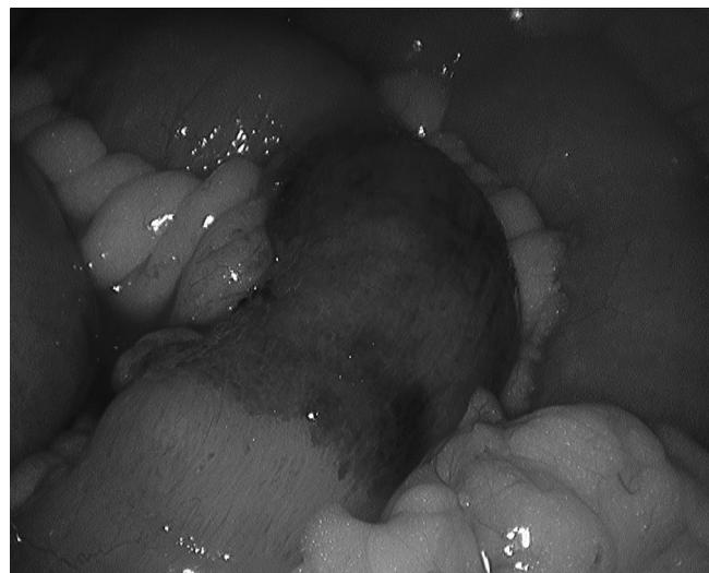
Figure 4. Laparoscopic view showing contused but viable small bowel, reduced from Spigelian hernia.

from some urinary retention and was therefore referred to the urology department for treatment. She was seen in the office approximately one week after discharge and was noted to be doing well.