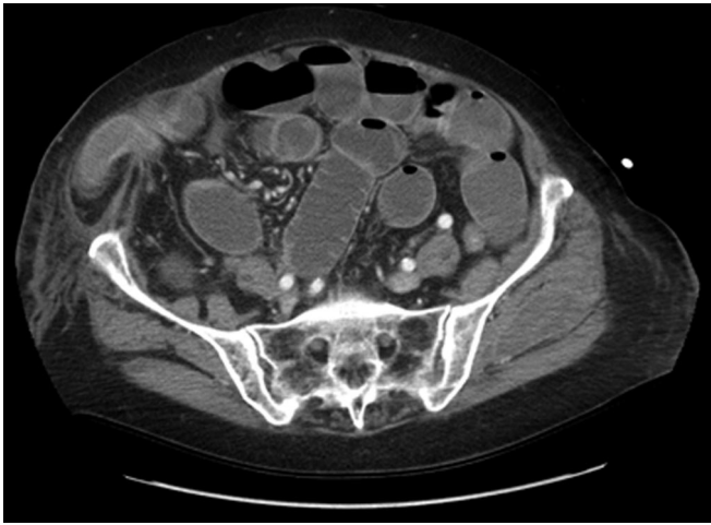
Figure 1. CT Scan image revealing right sided Spigelian hernia.

cedures but have a lower morbidity rate. Perineal procedure or Altermeier's 4 procedures are often performed in elderly and high-risk populations.