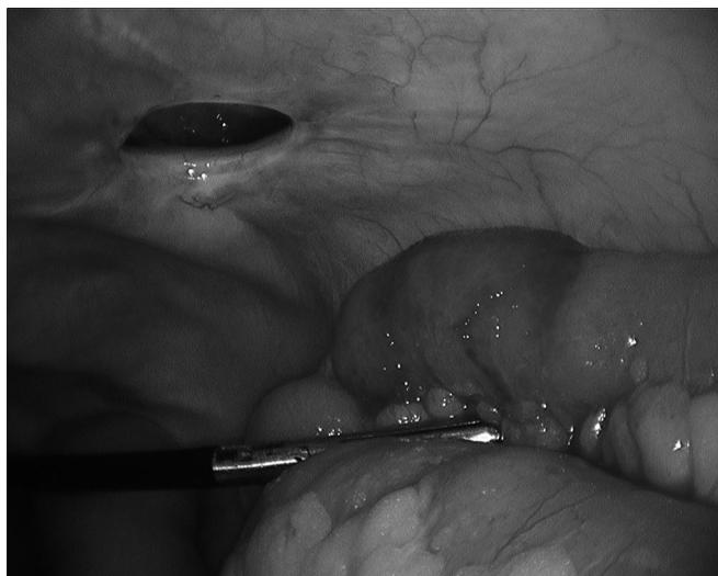
Figure 3. Laparoscopic view depicting Spigelian hernia and reduced bowel.