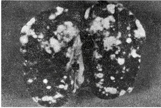
FIGURE 1: Spleen of Demoiselle cranes ( Anthropoides virgo ) showing caseous nodules, measuring 1–5 mm in size, on the cut surfaces of the organ.