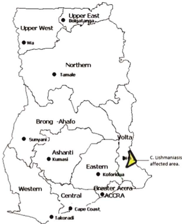
Fig. 1. Map of Ghana showing Ho District Outbreak area.

year is relatively dry. Malaria and onchocerciasis are the main diseases transmitted throughout the year. The main economic activities are farming and trading. There are also minor economic activities like pottery, woodcarving, kente weaving, and cattle rearing in the southern part of the Municipality.