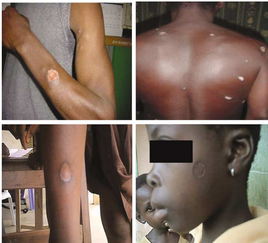
Fig. 3. Scars and ulcers that are healing.

Microscopic examination of biopsies fixed in formalin and embedded in paraffin showed intracellular kinetoplastic organisms reminiscent of Leishmania parasites/amastigotes (so called LD bodies) in 10 out of the 15 biopsy specimens. The other five specimens showed a heavy infiltrate of histiocytes, plasma cells, lymphocytes, neutrophils, and giant cells in the ulcers, suggestive of CL. Due to lack of appropriate equipment no photographs were taken of the histological sections.