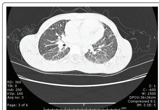
Figure 1 Chest computerized tomography of the patient at age 11 years, 7 years after hematopoietic stem cell transplantation and 17 months prior to lung transplantation.

Literature review: The mortality from pulmonary disease in patients with DC is reported to be approximately