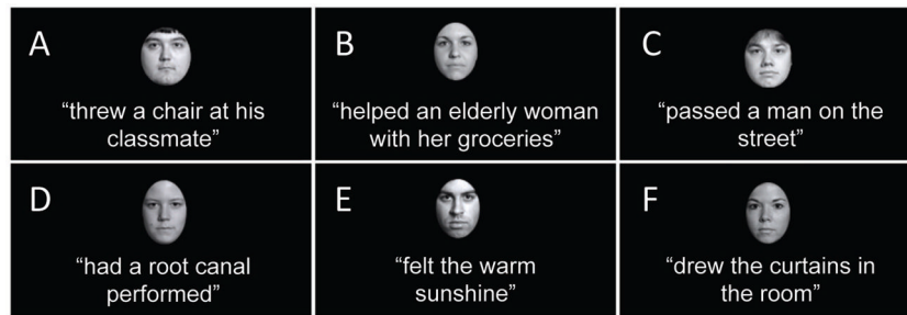
Fig. 1. Example of gossip stimuli. Examples of structurally neutral faces paired with: (A) negative gossip; (B) positive gossip; (C) neutral gossip; (D) negative non-social information; (E) positive non-social information; (F) neutral non-social information. See Supporting Online Materials for a complete list of sentences.