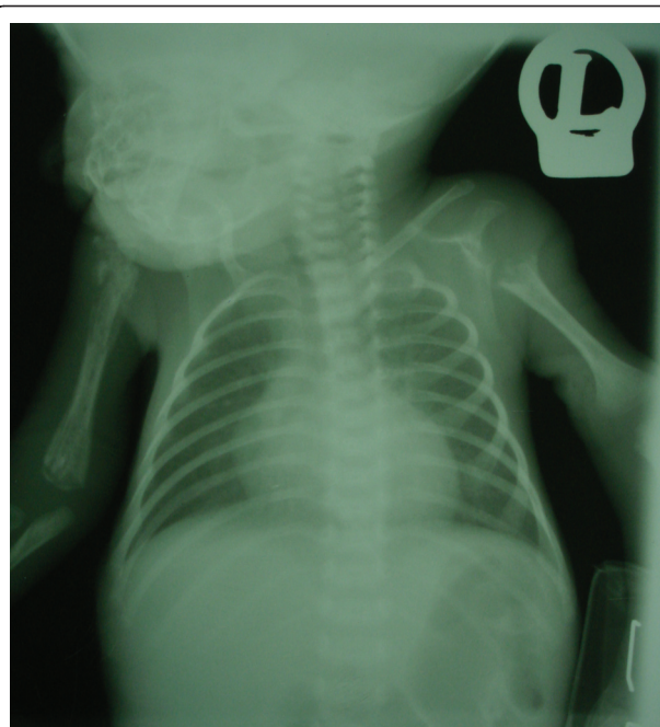
Figure 1 Chest X-ray obtained at the time of admission. Bilateral osteomyelitis in the humerus presented as osteolysis and involucrum. Also, there is sequestration because of osteonecrosis and a pathologic fracture in the proximal part of the humerus. Dislocation of right glenohumeral joint brings up the arthritis diagnosis. There is complete osteolysis in proximal metaphysis in the left humerus and arthritis in the left glenohumeral joint. The heart, lung and pleural space have a normal appearance, while the thymus is atrophic.

inadequacy of some basic facilities and staffing carry the risk of introduction of resistant hospital pathogens [4-6]. In the present case, all of the above-mentioned factors, combined with prematurity, predisposed the neonate to a higher risk of contracting nosocomial K. pneumoniae arthritis, osteomyelitis, septicemia and meningitis, although the common cause of osteoarthritis is Gram-positive cocci [7].