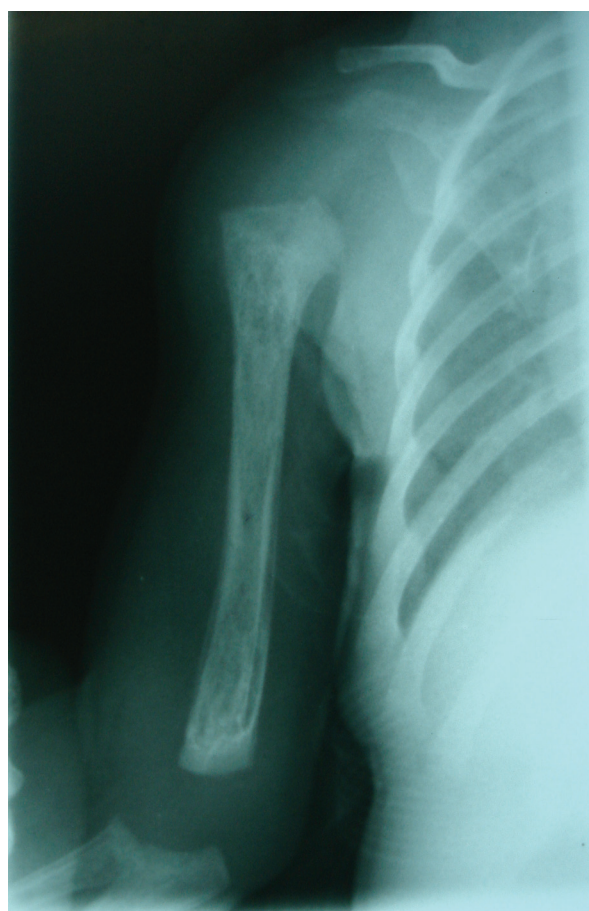
Figure 2 Chest X-ray obtained on the seventh day of oral anti-biotic therapy. The lytic lesions in the proximal and distal metaphysis in the right humerus are shown.