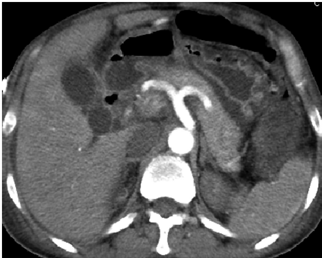
Figure 3: Contrast-enhanced abdominal CT scan showing a large hematoma at the duodenal wall