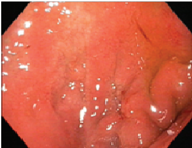
Figure 4: EDG at 8 th week revealed healed duodenal ulcer without any evidence of hematoma

the underlying fixed submucosa and serosa resulting in rupture of submucosal vessels and subsequent formation hematoma in predisposed individuals. Furthermore, intermittent systemic anti-coagulation during maintenance HD might have contributed to this complication in our case. Earlier, cases with duodenal hematomas subsequent to endoscopic interventions have been reported, [7,8] including in patients with ESRD and cirrhosis. [9,10] To our knowledge, this complication has never been reported from India.