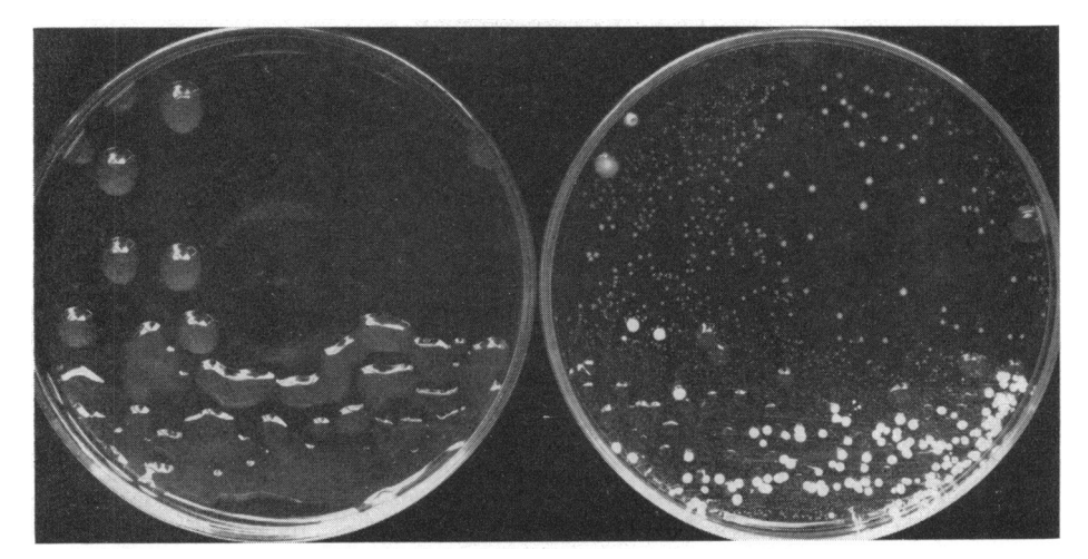
Fig. 1. Ten per cent sucrose agar streaked from a 3-day-old soil enrichment for leuconostoc. Left: plate contains 0.005% sodium azide. Right: control plate.

In early attempts to make sucrose agar more selective, we used either potassium cyanide or crystal violet alone or in combination with sodium azide, in concentrations from 0.01 to 0.05% of each agent. These were not entirely successful as they either failed to inhibit the undesired organisms or inhibited leuconostoc. A lower concentration of sodium azide used alone was successful. The basal medium was dispensed to give 100-ml amounts, sterilized at 121 C for 15 min, and just prior to use 0.5 ml of