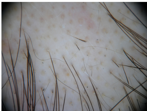
Figure 1 Alopecia areata: yellow dots and exclamation mark hairs.

Trichoscopy, or dermoscopy and videodermoscopy of the scalp, may reveal features of a specific type of hair loss. As an example, in the case of alopecia areata, a characteristic “yellow dot” pattern is often seen, as well as micro-exclamation hairs and black cadaverized hairs or “black dots” (Figure 1). 8,9 Dermoscopy in androgenetic alopecia reveals greater than 20% diversity in the hair diameter (Figure 2). 10 A brown, depressed halo at the follicular opening can be observed in early androgenetic alopecia and yellow dots can be seen in advanced cases. Further, a honeycomb-pigmented appearance can be appreciated in sun-exposed regions of