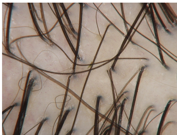
Figure 2 Androgenetic alopecia: hair diameter variability.

the scalp. 11 Dermoscopy of active lesions of tinea capitis reveals comma hairs, which are slightly curved, fractured hair shafts. 9