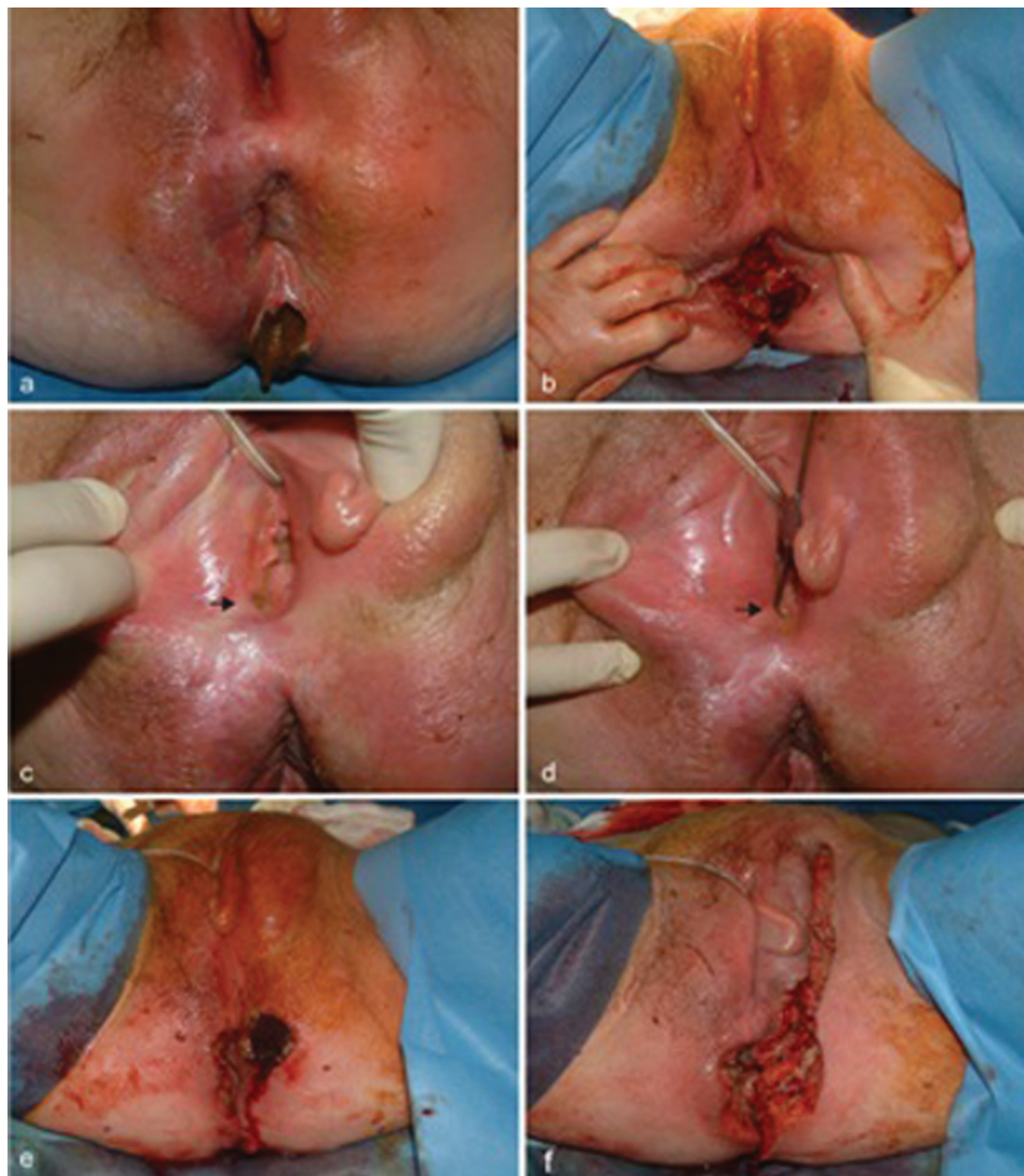
Figure 2 Rectocutaneous fistula (A), rectal tumour (B) with disruption of lower end of rectum. Fistulating tract into the vagina (arrow, C), explored with fistula probe (arrow, D). Fournier's gangrene (E), requiring extensive debridement of necrotic tissue (F).

This pdf has been created automatically from the final edited text and images.