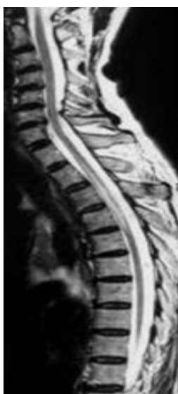
Fig. (1). T2 Sagittal spine MRI of a 30 year old lady presented to our hospital with left lower extremity weakness and low back pain showing the typical fusiform cord signal in TM.

cases. The cord involvement is usually central, uniform and symmetric in comparison to multiple sclerosis which typically affects the cord in a patchy way and the lesions are usually peripheral. Perivascular spread of monocytes; lymphocytes infiltrating focal areas of the cord along with astroglial and microglial activation are invariable findings on histopathology of TM. In some biopsies during the acute phases of TM, infiltrates of CD4 + and CD8 + T-lymphocytes were found to be prominent suggesting immune-mediated disease process. There is typically preservation of the subpial parenchyma suggesting ischemia as the ultimate cause of the cord lesions in TM. The pathology also differs depending on the etiology. For example necrotizing myelitis can be seen in NMO (see below) and paraneoplastic myelitis [35]. In MS and acute disseminated encephalomyelitis (ADEM) the lesions tend to have predilection to the white matter in comparison to the circumferential involvement in idiopathic TM [36].