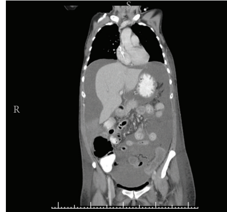
FIGURE 1: Computed tomography of the abdomen and pelvis showing colonic wall thickening and ascites in patient 4 with full-thickness eosinophilic colitis.

At colonoscopy, some patients have lymphonodular hyperplasia while others have endoscopic features of mild colitis including mucosal edema, patchy erythema, and loss of vascularity (Figure 2). Changes can occur throughout the colon but tend to be more prominent in the ascending colon and rectum. The only clear diagnostic criteria for any of the EGID entities pertain to eosinophilic esophagitis, which is defined by the presence of more than 15 eosinophils per high-power field in the esophageal squamous mucosa [16]. No such consensus exists for EC, although most authors have used a diagnostic threshold of 20 eosinophils per high-power field. Of note, normal values for tissue eosinophils vary widely between different segments of the colon, ranging from