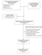
Figure 1. Flow Diagram of Literature Review Process for Identifying Studies Evaluating Use of Community Health Workers to Improve Screening Mammography Rates.