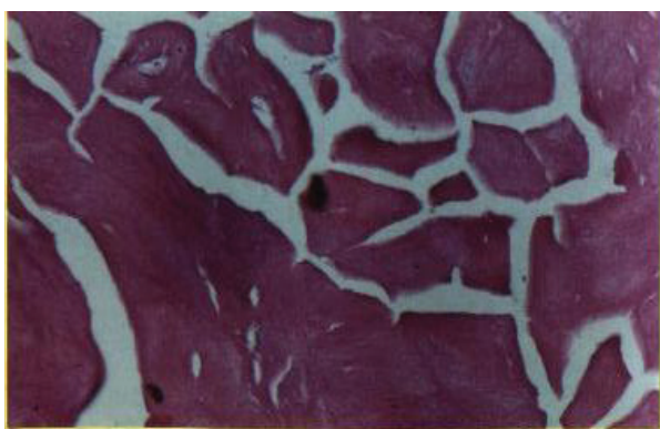
Figure 2 100 × H&E stain showing cystosarcoma phyllodes with area of necrosis.

[5,6]. Extra-osseous osteosarcomas have also been reported in thyroid gland, kidney, urinary bladder and uterus [7]. Overall, mammary osteosarcomas are biologically aggressive tumors characterized by early recurrences and hematogenous metastasis, frequently to the lungs [8]. Optimal management should include total excision of the neoplasm with an adequate margin for control of local disease. A simple mastectomy may be indicated to ensure complete excision of large tumors with cryptically infiltrative margins [2]. Axillary lymph node dissection is not indicated in the setting of clinically negative nodes. Although the role of adjuvant therapy is unclear, several studies involving a small number of patients suggest that adjuvant chemotherapy may be of value in patient management [8]. Distinguishing metaplastic carcinoma and carcinosarcoma from osteosarcoma of the breast is important, because the former necessitates treatment as primary breast cancer. Finally, although the breast is an unusual site of metastases, it is necessary to exclude the possibility of a metastatic lesion, as well as primary osseous osteosarcoma, before establishing the diagnosis as osteosarcoma of the breast.