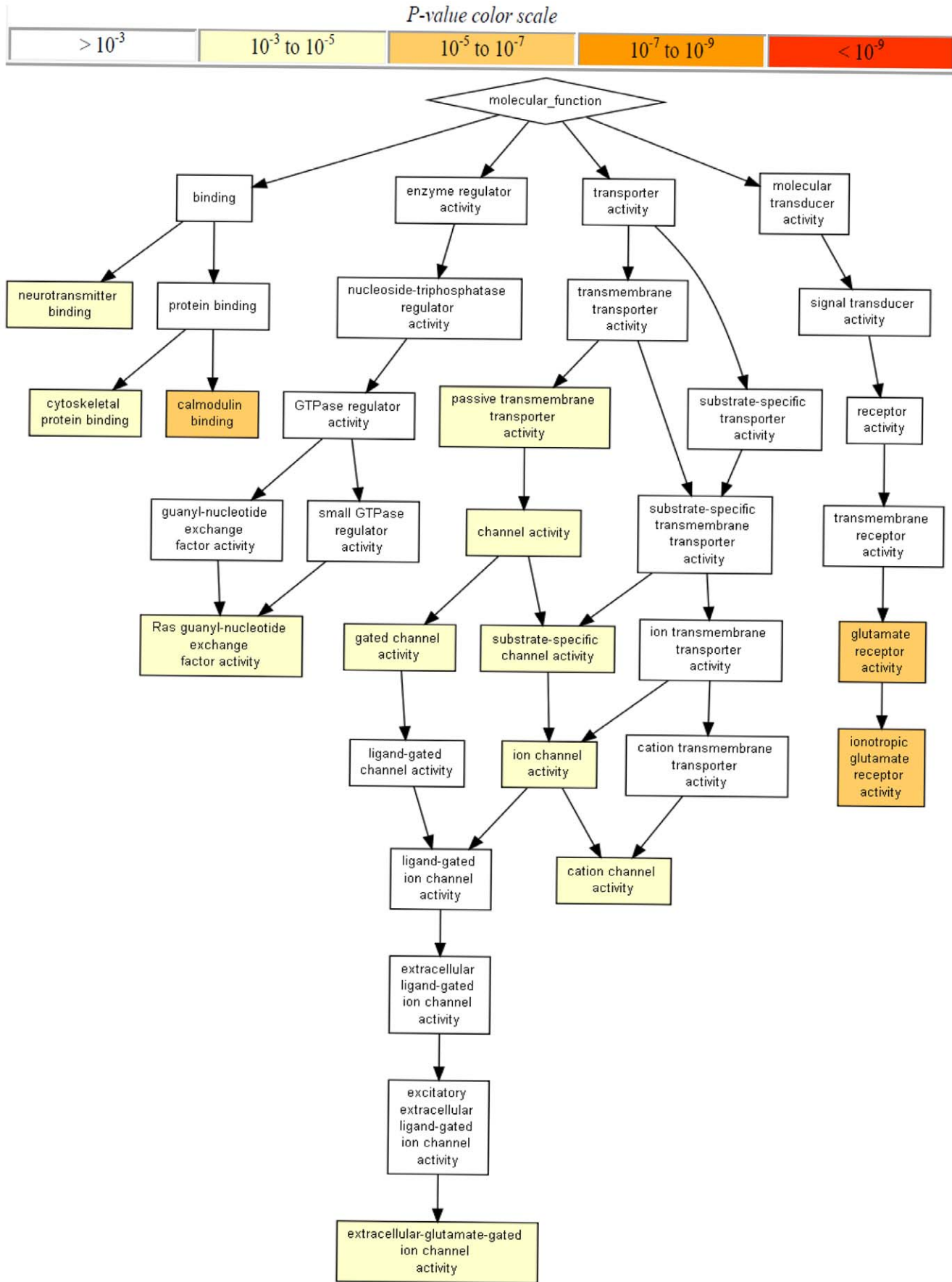
Figure 3. Gene function ontology enrichment by epistatic signals in the MICROS population. doi:10.1371/journal.pone.0023836.g003