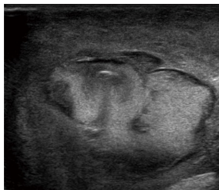
Figure 1 Ultrasonography of Strangulated midline hernia. Hyperechoic haemorrhagic loops surrounded by a transonic (black) thin film of fluid.

US imaging, like CT, largely finds a mass in the abdominal wall corresponding to the contents of the hernia sac and distinguishes it from other masses such as cysts, hematomas, neoplasms or varicoceles [7] . US may disclose the presence of the hernia signs (Figure 1) and is particularly useful in small midline hernias containing mesenteric fat or to study the pediatric population. US may detect the presence of hernias in the groin with a complete regional evaluation and hiatal hernias. A dynamic study of the gastro-esophageal junction is also possible. In a case of com-