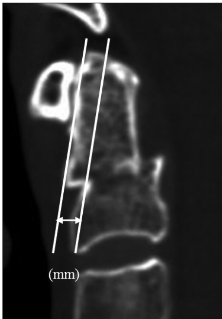
Fig. 1. Odontoid fracture displacement. A tangent line is drawn along the anterior aspect of the odontoid fragment and the anterior aspect of the C2 body. A transverse line is drawn connecting these 2 lines. This distance is measured in millimeters and represents sagittal fracture displacement.