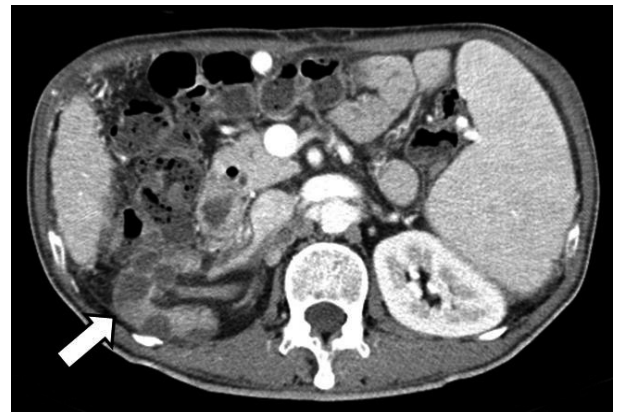
Fig. 3. A follow-up CT image shows an infarcted right kidney with multifocal necrotic low attenuated lesions (arrow) in the renal parenchyma. CT, computed tomography.