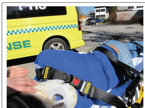
Figure 1 The lateral trauma position. A patient has been positioned in the lateral trauma position on a stretcher. Observe that the most cephalic stretcher belt has been placed above the shoulder to prevent forward movement on the stretcher.

After checking airways and breathing, the unconscious trauma patient is carefully rolled to a lateral recovery position, maintaining manual in-line stabilization with the c-collar in place (see Table 1 and Figure 1). The method was described in the EMS protocols, a teaching video was made, and training and retraining was instituted locally. PHTLS Norway has adopted LTP in their educational program (Sindre Mellesmo, personal communication). In addition to being demonstrated in PHTLS courses, LTP is now part of the written protocols in some Norwegian EMS and is described in the