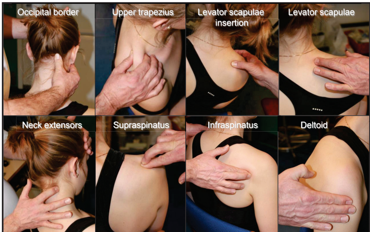
Figure 2 Palpation of the eight examined neck/shoulder locations (only illustrated for the right side).

The examiners determined tenderness by deep palpation of eight anatomical neck/shoulder locations on the left and right side. Based on the participants response and feedback during the palpation, the examiner used a score of 0-2, corresponding to 'no tenderness', 'some tenderness' or 'severe tenderness', respectively, for each anatomical location (Figure 2):