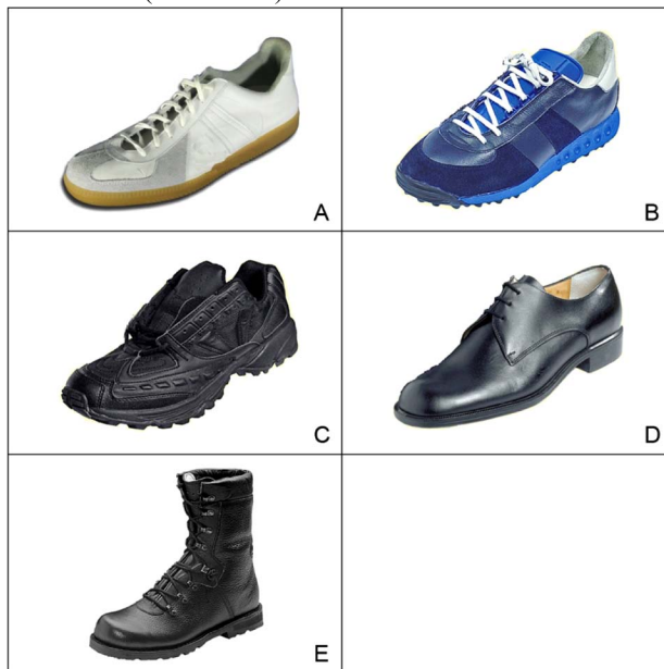
Fig. (1). Shoes used in measurements. A) Indoor (army gym shoes; n=22); B) Outdoor old (army jogging shoes B; n=9); C) Outdoor new (army sports shoes (UKgear) A/B; n=11); D) Leather dress shoes (loafers B; n=26); E) Combat boots (army combat boots type 2000; n=32).

After walking barefoot at first the participants wore the shoes listed in Fig. (1) consecutively. The number of participants owning the analysed shoes is listed in the caption of Fig. (1). Detailed information about the investigated footwear is listed up in Table 1. In addition, nine soldiers were analysed wearing privately owned sports shoes, which they classed as comfortable. These shoes were treated as one group. It can be seen as a reference if a comfortable feeling is linked to optimal function. An EMG analysis was taken as the subjects walked on a treadmill at a constant speed of 3.2 km/h. The ordinary length of stride was measured by video analysis using the Dartfish software (Version 4.0.6.0.; Dartfish; Taufkirchen, Germany) and was about 0.64 m (+/- 0.01 m).