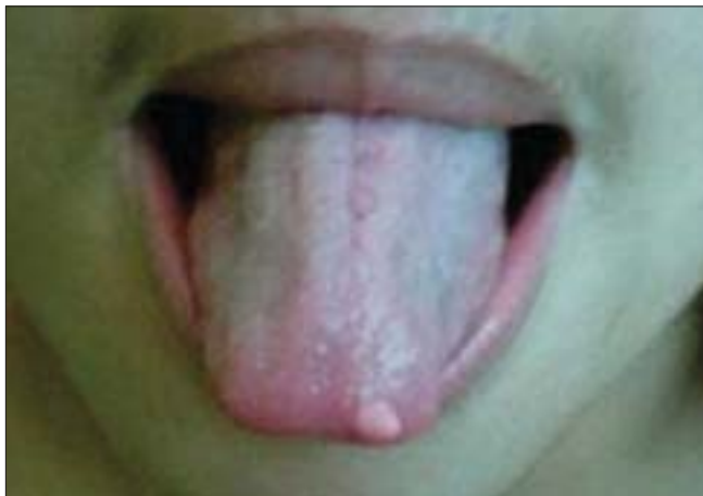
Figure 1: Papillomatosis lesion on the tip of the tongue

The possibility of oral exposure to HPV is through oral sex as well as through intimate contact. The