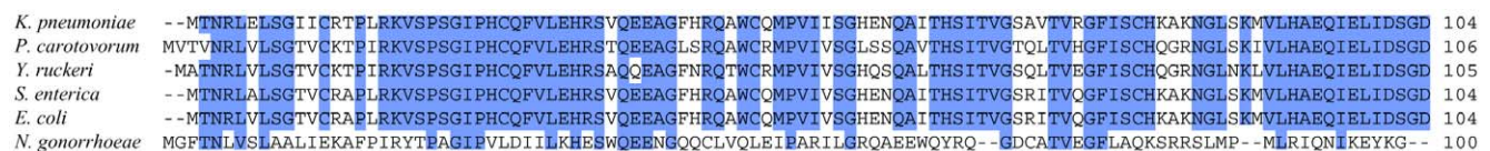
Figure 1. Multiple amino acid sequence alignment of PriB homologs. Amino acid sequences of Klebsiella pneumoniae PriB (GenBank ID:YP_001338213), Pectobacterium carotovorum PriB (GenBank ID:C6DE14), Yersinia ruckeri PriB (GenBank ID:ZP_04617249), Salmonella enterica PriB (GenBank ID:AAL23212), Escherichia coli PriB (GenBank ID:NP_418622), and Neisseria gonorrhoeae PriB (GenBank ID:YP_207725) were aligned using the program ClustalX [15]. Amino acid residues that are identical in at least five of the six aligned PriB proteins are highlighted in blue. doi:10.1371/journal.pone.0024494.g001

Due to the high degree of similarity between K. pneumoniae PriB and E. coli PriB at the level of primary and quaternary structure, we hypothesized that the mechanism of ssDNA binding is similar between the two PriB homologs. To test this hypothesis, we used fluorescence polarization spectroscopy to measure the DNA binding activity of K. pneumoniae PriB to compare it with that of E. coli PriB. For these experiments, we measured the apparent dissociation constant for the interaction between K. pneumoniae PriB and fluorescein-labeled ssDNA oligonucleotides. The fluorescein tag on the ssDNAs allows us to measure PriB binding to the ssDNA due to the increase in fluorescence anisotropy of the PriB:ssDNA complex relative to the unbound ssDNA. K. pneumoniae PriB protein was serially diluted and incubated with 1 nM fluorescein-labeled ssDNA and the fluorescence anisotropy was measured. Apparent dissociation constants were obtained by