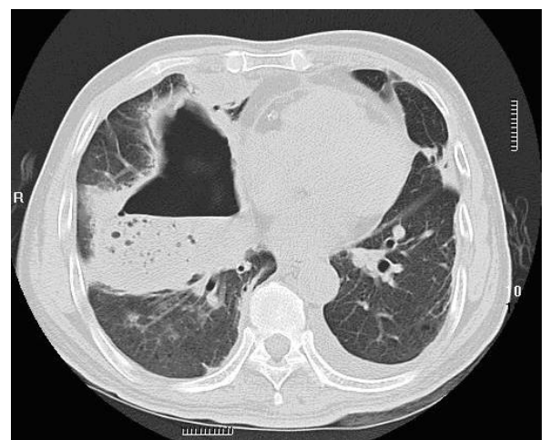
Figure 3 Computed tomography scan of the thorax. The scan shows features typical of pulmonary abscesses, consolidation with a single cavity containing an air-fluid level in the right lung after six days of intravenous cefepime treatment.