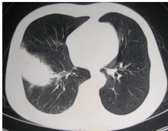
Figure 1 Computed tomography scan (GE Medical System, lightspeed 16) of the thorax showing features of lobar pneumonia. In this image right lung lower lobe soft tissue density shadow can be seen.

performed and the purulent fluid grew R. pickettii . The chest tube placed for drainage remained in the cavity of the abscess for rinsing with sterile sodium chloride solution. Because the pathogen had not responded to two antibiotic treatments, its antimicrobial susceptibilities were studied by the disk diffusion method of the Clinical and Laboratory Standards Institute (CLSI) (9). The breakpoints used to determine resistance and