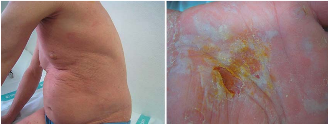
Fig. 1. The patient presented skin infiltration of 90% of the total body surface (left), with palmoplantar keratoderma (right).