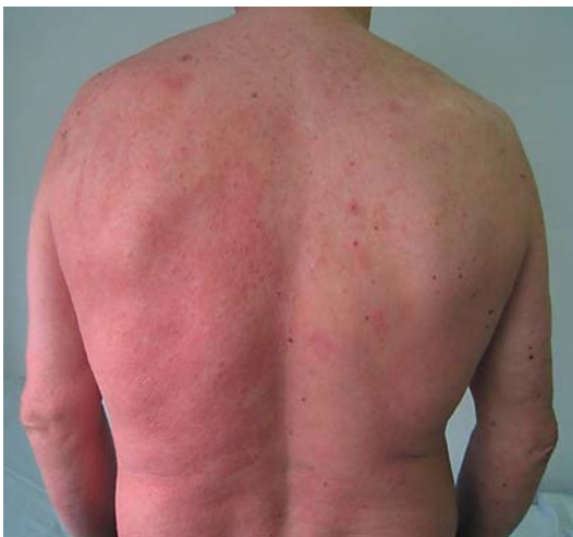
Fig. 3. After combined treatment with bexarotene and denileukin diftitox, the skin lesions improved partially.