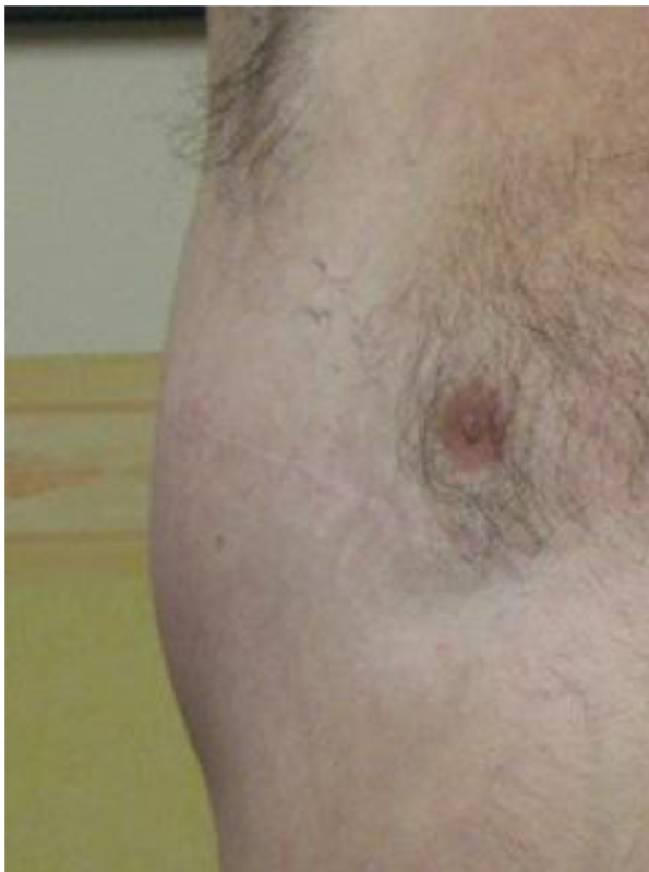
Figure 9 Male 60 years old, accidental trauma, with fall on the chest. After 18 REAC-TO treatment in three weeks.