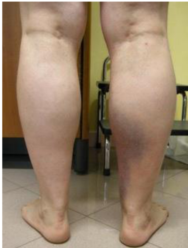
Figure 11 Male 30 years old, crushing accidental trauma on right leg. Before REAC-TO treatment.

treatment, a significant decrease in pain and functional recovery was reported, eliminating the need for painkillers. While REAC-TO treatments were underway, no additional local therapy was applied. Following completion of the REAC-TO treatments, modest local edema and slight discoloration from hemosiderin deposition remained (Figures 12 and 13). However, total recovery of limb function was achieved.