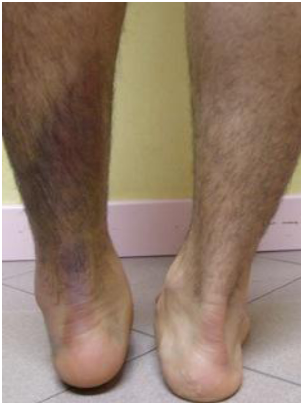
Figure 21 Male 28 years old, hit by a car. Before REAC-TO treatment.

efficacy in speeding the healing time of post-traumatic injuries compared with the time usually required for similar traumas treated with prompt functional recovery and rapid-acting analgesics. Furthermore, this treatment approach represents a noninvasive, painless, and safe treatment that provides functional recovery.