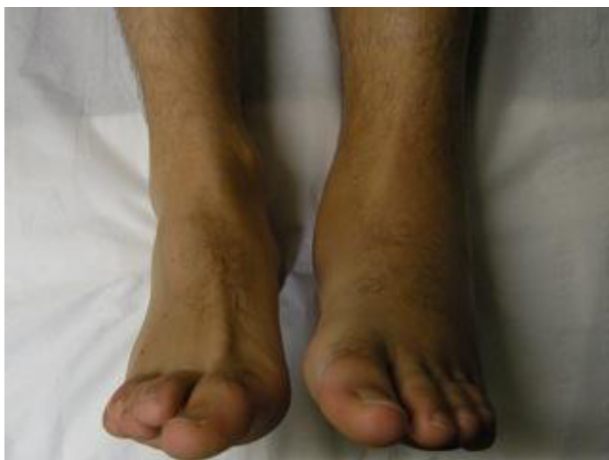
Figure 18 Male 35 years old, accidental fall from a ladder. Before REAC-TO treatment.

a total of 18 sessions. Following completion of the first treatment, a significant reduction in pain was reported, and sufficient functional recovery was achieved to enable the patient to walk. The patient did not require further treatment with painkillers. Thirty days after the start of treatment, complete functional recovery of the tibiotarsal joint was demonstrated, and resolution of the hematoma in the heel was achieved. Recovery of salient bone features in the joint was also observed (Figure 19).