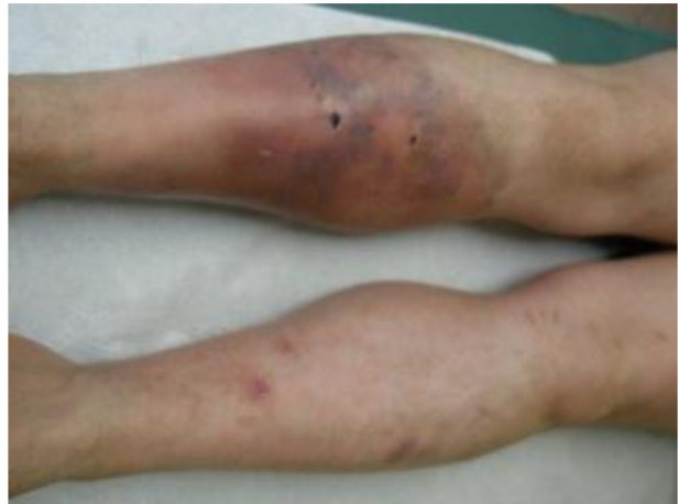
Figure 10 Male 30 years old, crushing accidental trauma on right leg. Before REAC-TO treatment.

treatment, a significant decrease in pain and functional recovery was reported, eliminating the need for painkillers. While REAC-TO treatments were underway, no additional local therapy was applied. Following completion of the REAC-TO treatments, modest local edema and slight discoloration from hemosiderin deposition remained (Figures 12 and 13). However, total recovery of limb function was achieved.