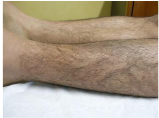
Figure 22 Male 28 years old, hit by a car. Images taken at follow-up done after 14 days from the end of treatment course, with 18 REAC-TO sessions performed in nine days.

The cases and results presented in this study are representative of those achieved in our clinics with the application of REAC-TO to post-traumatic injuries. REAC-TO has shown