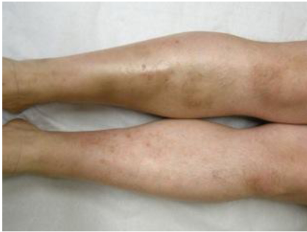
Figure 12 Male 30 years old, crushing accidental trauma on right leg. After 18 REAC-TO treatment in three weeks.