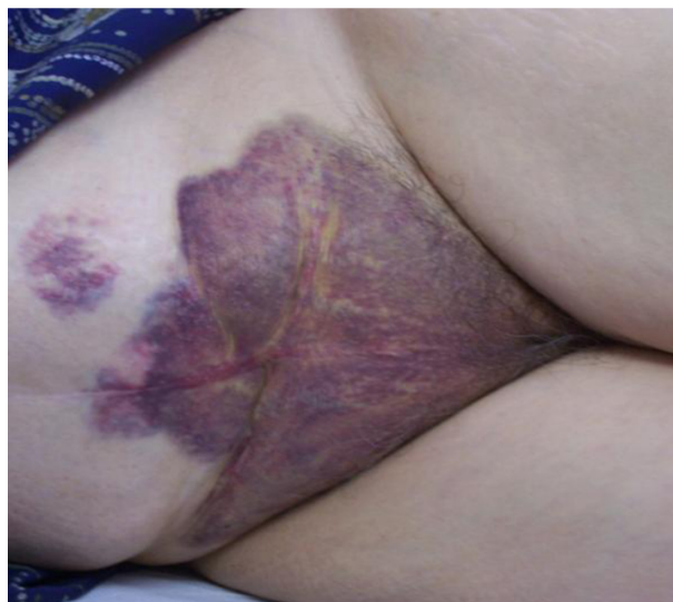
Figure 3 Female 70 years old, treated with oral anticoagulants, accidental fall while descending the stairs. Before REAC-TO treatment.