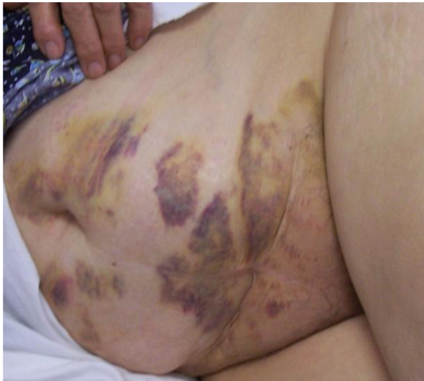
Figure 5 Female 70 years old, treated with oral anticoagulants, accidental fall while descending the stairs. After 12 REAC-TO treatment in six days.