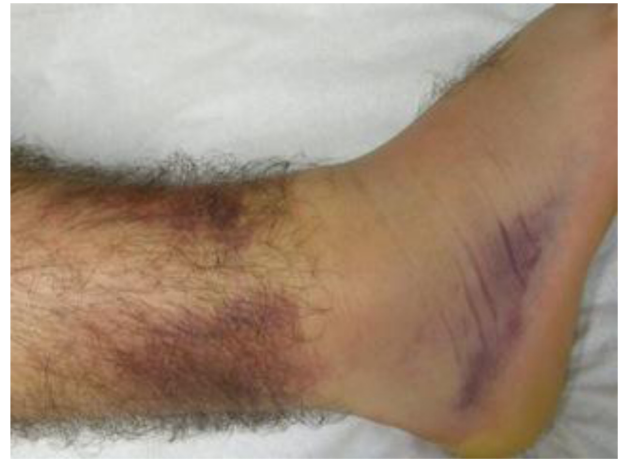
Figure 14 Male 18 years old, accidentally fell on the steps of a staircase. Before REAC-TO treatment.