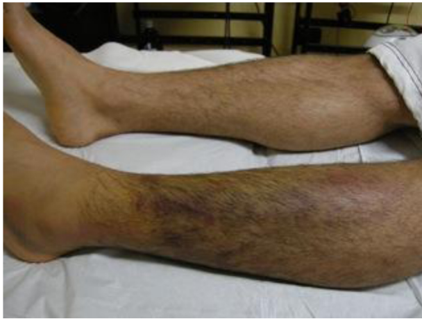
Figure 20 Male 28 years old, hit by a car. Before REAC-TO treatment.

a rapid-acting analgesic. REAC-TO treatments were also associated with antiedematous, anti-inflammatory, and regenerative 17 effects.