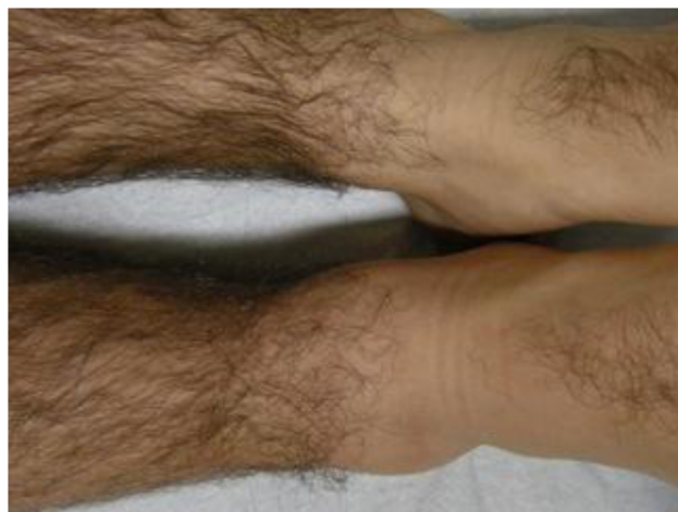
Figure 17 Male 18 years old, accidentally fell on the steps of a staircase. Images taken at follow-up done after 12 days from the end of treatment course, with 12 REAC-TO sessions performed in six days.