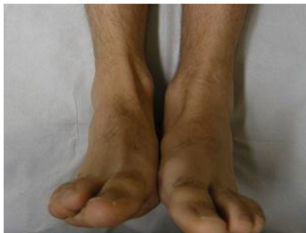
Figure 19 Male 35 years old, accidental fall from a ladder. Images taken at follow-up done after 30 days from the end of treatment course, with 12 REAC-TO sessions performed in six days.

The images presented here for subjects here clearly demonstrate the effectiveness of REAC-TO, with recovery achieved following post-traumatic injuries involving resolution of hematomas and hemorrhagic suffusion. In addition, almost immediate and progressive recovery of loss of function was observed, with REAC-TO treatments representing