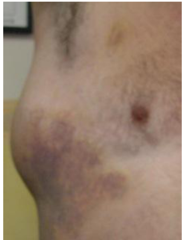
Figure 7 Male 60 years old, accidental trauma, with fall on the chest. Before REAC-TO treatment.