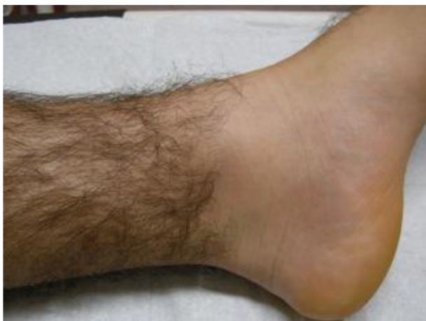
Figure 16 Male 18 years old, accidentally fell on the steps of a staircase. Images taken at follow-up done after 12 days from the end of treatment course, with 12 REAC-TO sessions performed in six days.