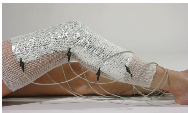
Figure 1 REAC Tissue Optimization (REAC-TO) protocol consisting of one hundred radiofrequency 2.4 GHz bursts of 0.5 seconds spaced with 4.5 seconds pause, applied by a special laminar aluminum probe on the skin to treat.

A 70-year-old woman was treated with oral anticoagulants after an accidental fall while descending a flight of stairs. The fall resulted in a significant hematoma, with hemorrhagic suffusion present in the buttocks (Figure 2) and inguinal canal (Figure 3), resulting in significant pain in the traumatized areas. Immediately following the trauma, the subject started treatment with REAC-TO. Two sessions were performed per day, one hour apart, for six days. No other therapy was locally applied while REAC-TO treatments were being conducted. Following the first session, a rapid improvement was observed in the subject's condition, and in her level of pain. As a result, an almost full recovery was achieved within six days (Figures 4 and 5).