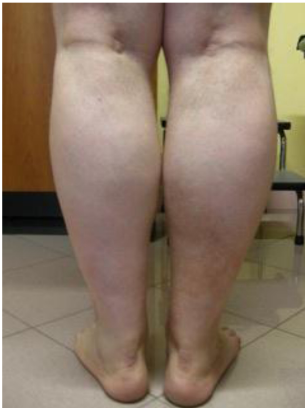
Figure 13 Male 30 years old, crushing accidental trauma on right leg. After 18 REAC-TO treatment in three weeks.

immediately following the trauma, with two sessions conducted daily for 12 days. Following the first treatment, a significant reduction in pain and functional recovery were reported. During REAC-TO treatments, the subject also did not receive any other local therapies. After 12 days, complete functional recovery of the tibiotalar joint was achieved, and the ecchymotic suffusion was resolved (Figures 16 and 17).