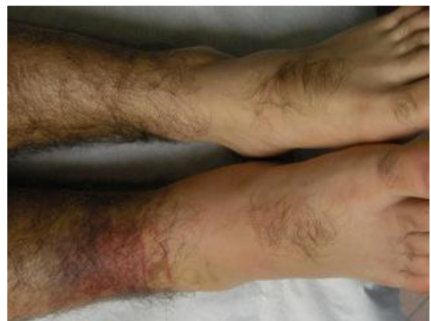
Figure 15 Male 18 years old, accidentally fell on the steps of a staircase. Before REAC-TO treatment.

A 35-year-old man accidentally fell from a ladder, resulting in a conspicuous ecchymotic suffusion that affected the tibiotalar joint, and was associated with a hematoma in the heel (Figure 18). Severe pain and loss of function in the traumatized limb were reported by the subject. REAC-TO treatments were started immediately, with two sessions conducted daily for