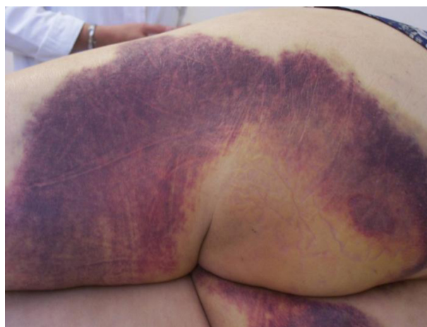
Figure 2 Female 70 years old, treated with oral anticoagulants, accidental fall while descending the stairs. Before REAC-TO treatment.