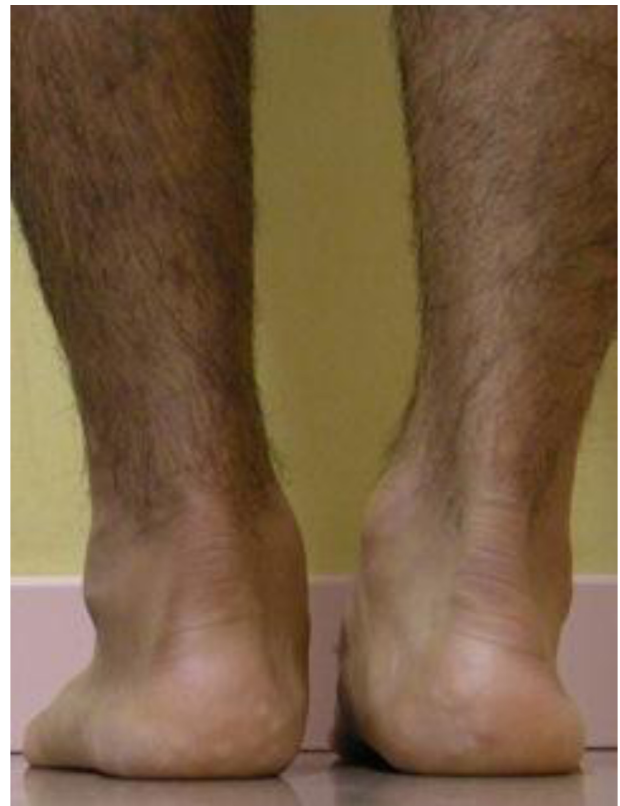
Figure 23 Male 28 years old, hit by a car. Images taken at follow-up done after 14 days from the end of treatment course, with 18 REAC-TO sessions performed in nine days.