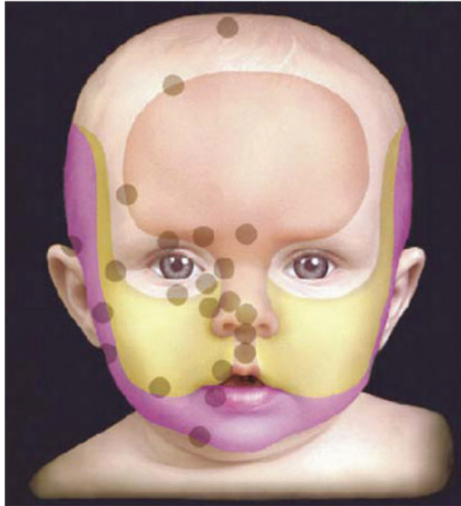
Fig 2. Note concentration of hemangiomas along lines of fusion. Arch Dermatol. 2003 Jul; 139(7): 869 – 875.