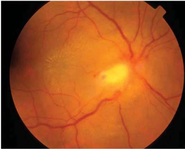
Figure 1 Fundus biomicroscopy of patient no. 2 showing optic nerve swelling with a retinal infiltrate adjacent to optic nerve and macular star of exudates.

was better than 20/40 in two eyes, between 20/40 and 20/200 in five eyes, and less than 20/200 in one eye. At the end of follow-up, mean Snellen BCVA was 20/84. Seven eyes of six patients had improved vision, and one patient, who had initially presented with good VA, kept the same VA (Table 1).