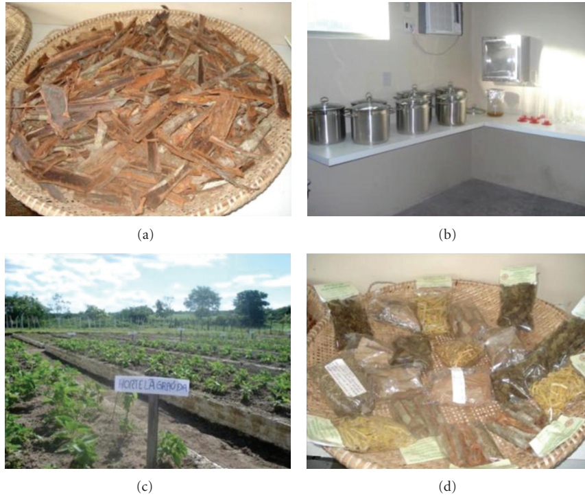
FIGURE 5: Fulni-ô office of Medicinal Plant Care in Fulni-ô Indigenous land, Águas Belas (NE Brazil). (a) Bark of “Aroeira,” a medicinal plant; (b) equipment for the production of herbal remedies; (c) bed and a nursery for the cultivation of medicinal plants; (d) herbal remedies.

contact with a different reality. In addition to detecting the presence of exotic species in the local pharmacopoeia, we also applied the index proposed. This index considers different variables jointly in order to detect the relative importance of plant resources in cultural practices of healthcare access. Thus, results showed that among the ten most cited plants, five are exotic. This information leads us to believe that in addition to being part of local knowledge, the exotic species play an important role in traditional practices due to their versatility and consensus about their use.