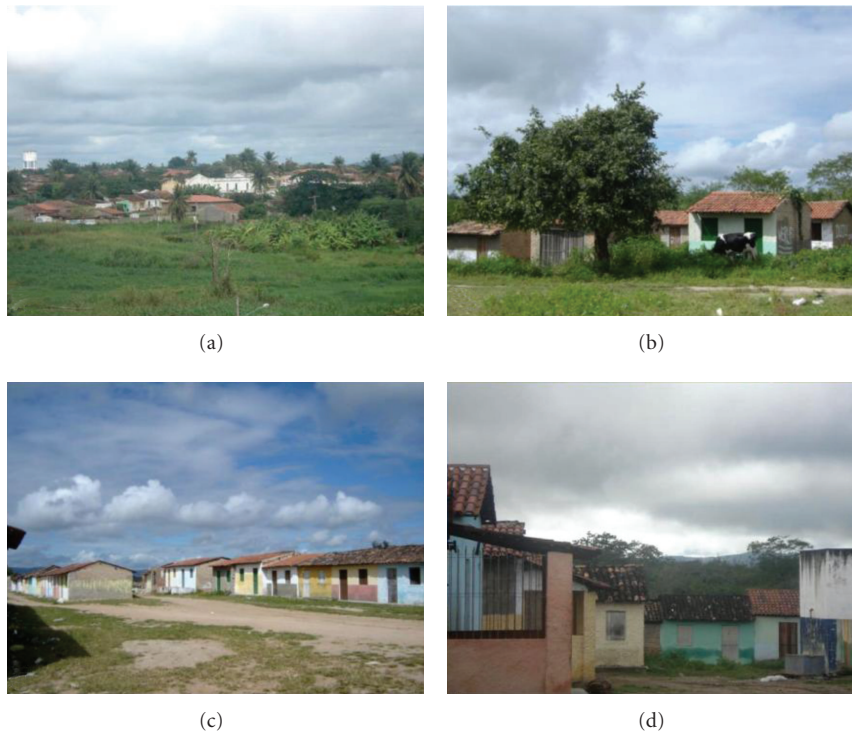
FIGURE 1: Fulni-ô Indigenous land, Águas Belas (NE Brazil). (a) “Main Village”; (b)–(d) “Ouricuri Village”.