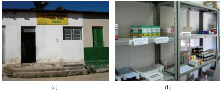
FIGURE 3: Base pole in Fulni-ô Indigenous land, Águas Belas (NE Brazil). (a) Base pole; (b) store of medications in the Base pole.