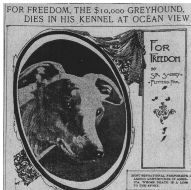
Figure 5. During a 1900–1901 equine influenza epizootic, the US champion racing greyhound For Freedom died of “an attack of the epizooty, which is prevalent here among horses” ( The San Francisco Call , 11 November 1901).

Influenza-like illnesses in dogs and cats, apparently acquired from either horses or, less commonly, humans, have been reported for centuries during epidemics and equine epizootics, 1,62 probably representing in most instances occasional “dead-end” host transmission. Apparent canine influenza was reported, for example, during the 1675–1676, the 1760, and the 1767 epidemics/equine epizootics, 1,43,57,59,61 and substantial outbreaks of possible influenza in dogs were seen during the 1782 pandemic, anecdotally associated with transmission to parrots, 75 and the Australian epidemic of 1851–1852. 76 Similar canine and feline illnesses and deaths were reported frequently in the 1872 equine panzootic as well and have more recently been reported in the 2009 H1N1 pandemic. Influenza cases and deaths in racing greyhounds have been recognized for over a century ( The San Francisco Call , 11 November 1901;