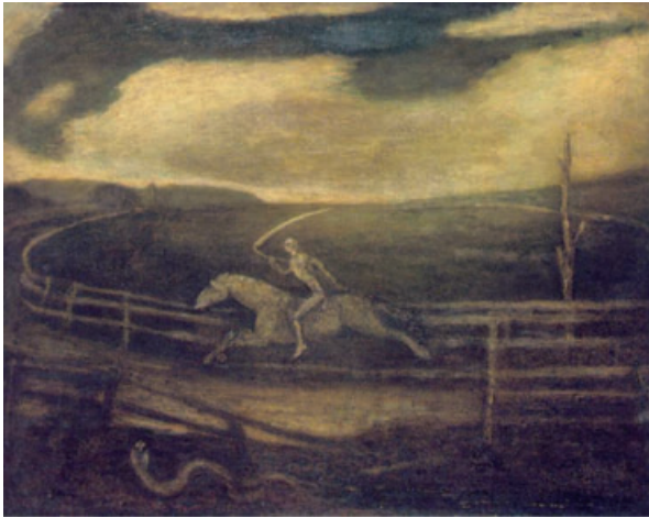
Figure 1. The Race Track (Death on a Pale Horse) , by Albert Pinkham Ryder (1847–1917), ca. 1896, oil on canvas, Cleveland Museum of Art. Katherine Anne Porter's (1890–1980) classic novella Pale Horse, Pale Rider , 2 which describes both the 1918 death of her lover and her own near death from influenza has fixed in the imagination of many readers an association between the chilling biblical imagery of the “pale horse” ( Revelation 6:8) and the enormous death toll of the 1918–1919 pandemic.

Galliformes (e.g., chickens, turkeys, quails) are susceptible, after adaptation, to infection with wild bird-derived IAV. 12,13 Avian IAV are antigenically and genetically diverse; all 16 identified hemagglutinin (HA) and nine neuraminidase (NA) subtypes have been identified in a great variety of combinations. 8,9,14 The existence of a large number of different HA–NA subtype combinations, without evidence of genetic linkage among the specific segments, indicates that mixed IAV infection and reassortment in wild birds is extremely common 15,16 , and it further suggests that in wild birds IAV exist as transient genome constellations. 15 It is also likely that IAV can be maintained in the environment, e.g., in pond water and mud; 17–19 the significance of this in relation to the complex ecobiology of IAV is still poorly understood 14 but remains an important subject for further research.