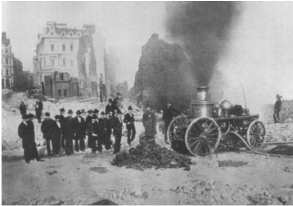
Figure 4. The Boston fire of 9 November 1872 burned down much of the financial district of Boston. 67 Among other factors, the devastation of the fire has been attributed to the ongoing influenza panzootic ( Boston , 11 November 1872). Because most of the equine work force was incapacitated, fire stations throughout the United States recruited teams of men to pull fire wagons. The slow response times of the Boston teams are believed by many to have led to the fire getting out of control. Above, onlookers on Devonshire Street assemble around Steamer Number 10, from the Fire House on Mount Vernon Street. At far right a fireman with a hose sprays the ruins.

to be local, to affect mostly young horses, and to feature much lower attack rates. 68,69 One of the last widespread equine influenza epizootics in the United States occurred in the winter of 1915–1916, concurrent with a major epidemic season. 70