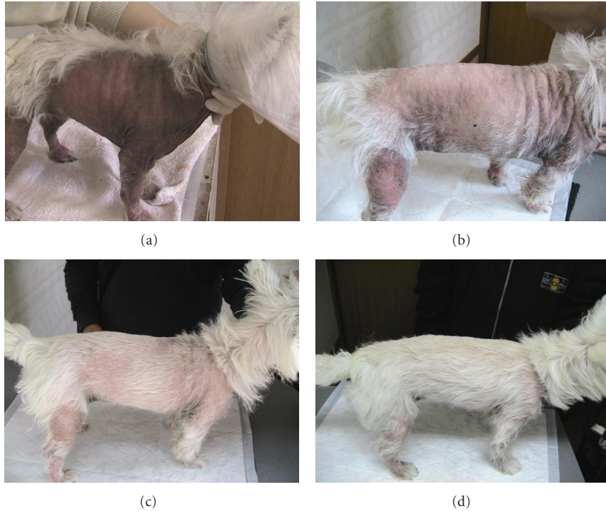
FIGURE 2: Clinical characteristics of Dog 5 at start of the treatment (D0), 6 weeks after D0, and 12 weeks after treatment are shown in Figures 2(a), 2(b), and 2(c), respectively. Progressive changes in disease severity were seen in the 12-week trial period. The dog was treated continuously after the completion of the trial. Clinical symptoms improved 18 weeks after D0 (Figure 2(d)).

each subscore was found between the 4-week pre-treatment assessment and week 0 ( P > 0.05 ). When CADESI-03 modification total scores at week 0 were compared to those at 6 weeks after treatment, a significant decrease in scores was noted (26.0%, P < 0.05 ). No significant difference was found between CADESI-03 modification total score at week 6 and week 12. Erythema was the parameter most reduced in the trial period (week 6: 36.2%, P < 0.005 ; week 12: 46.3%, P < 0.05 ) whereas the lichenification score was reduced, but not significantly (week 6: 14.4%, P > 0.05 ; week 12: 43.3%, P > 0.05 ). There was a decrease in excoriation subscore (week 6: 39.9%, P < 0.05 ; week 12: 72.0%, P > 0.05 ) and alopecia subscore (week 6: 19.9%, P < 0.05 ; week 12: 30.5%, P > 0.05 ) from week 0 to week 6 or week 12 (Figures 1(a) to 1(e)). No significant difference of each subscore was found between week 6 and week 12. Progressive changes in Dog 5 over the 12-week period are shown in Figures 2(a) to 2(d).