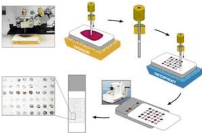
Figure 2. Schematic depicting a tissue microarray (TMA) 2