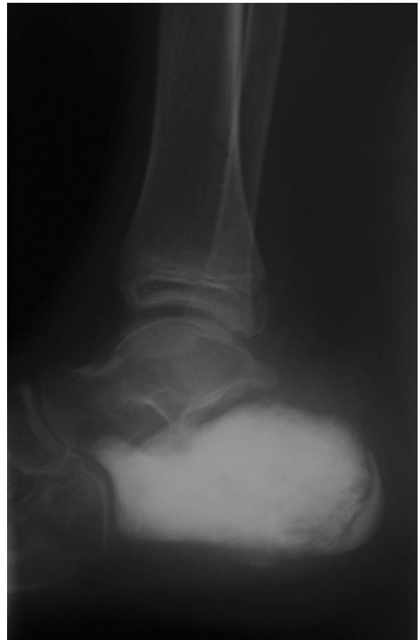
Figure 2 Lateral radiographs of the patient's foot show a condensed lesion in the calcaneus with aggressive periosteal reaction and soft-tissue swelling.

A biopsy was performed and histopathology showed a malignant small round-cell tumor, identified as Ewing's sarcoma at immunohistochemistry study. Chest radiography and liver ultrasonography excluded the presence of any distant metastases. Our patient started neoadjuvant chemotherapy and underwent a below-knee amputation. Postoperative histology confirmed the diagnosis. Our patient remained disease-free for six months after diagnosis. Based on these findings, a diagnosis of Ewing's sarcoma of the calcaneus was made.