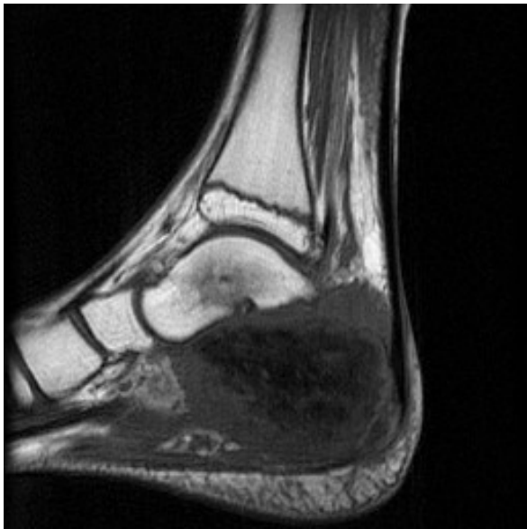
Figure 4 MRI of the patient's foot shows a hypointense tumor mass on T1-weighted spin-echo sequences compared to surrounding musculature. The skip lesion of the talus displays a hyposignal on T1-weighted sequences.