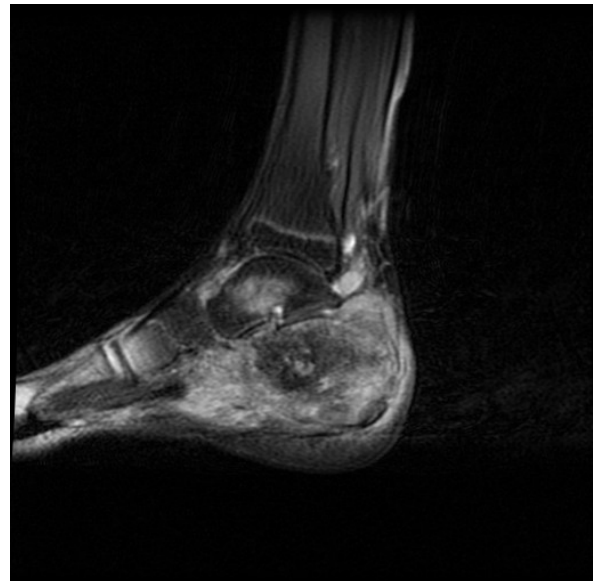
Figure 6 T1-weighted fat saturation sequence after intravenous gadolinium chelate administration reveals strong contrast enhancement of the tumor. We note the skip lesion in the talus as a low signal mass with peripheral enhancement.

less commonly in flat bones [1]. Clinical and laboratory features include local pain, soft-tissue swelling and erythema, occasionally accompanied with fever, anemia, leukocytosis, and accelerated erythrocyte sedimentation rate [2]. It rarely affects the feet.