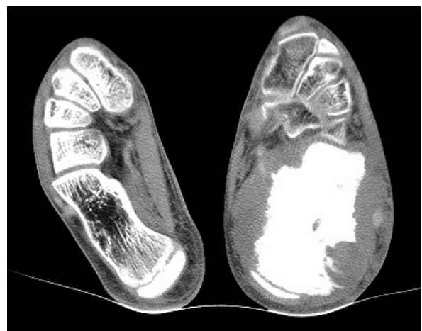
Figure 3 CT image of the patient's foot, revealing a soft-tissue mass originating from the calcaneus, permeative destruction of the entire bone with aggressive spiculated periosteal reaction and cortical destruction.

Ewing's sarcoma is a rare malignant neoplasm, predominantly affecting young patients of the ages five to 20 years. It involves the diaphyses of long bones and occurs