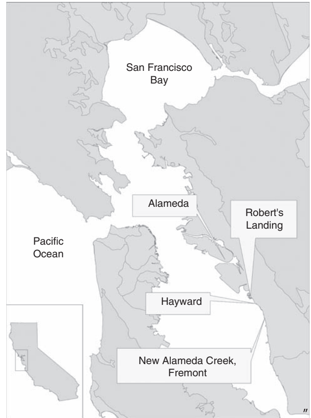
Figure 1 Map of San Francisco Bay. Study sites: Elsie Roemer Marsh, Alameda; Robert's Landing and Hayward. (The site of the first Spartina alterniflora introduction to San Francisco Bay at Alameda Creek, Fremont is also shown.)

In San Francisco Bay, a rapid invasion of hybrid Spartina occurred after S. alterniflora from the Atlantic and Gulf coast of North America hybridized with the California native species, S. foliosa . S. alterniflora was deliberately planted at a former salt pond at Alameda Creek, Fremont in the 1970s (Figure 1; Faber, 2000); it is inferred that the first hybridizations occurred there (Daehler and Strong, 1997; Ayres et al. , 1999). Introgressive hybridization, potentially occurring in parallel at more than one geographic location over time, threatens the native S. foliosa with local extinction, and has left only a few nonhybrid S. alterniflora in San Francisco Bay. Whereas backcrossing produced a diverse array of advanced generation hybrid genotypes within a period of 30 years (Ayres et al. , 1999). Hybrids were planted in a few sites and spread by floating seed to the shores of much of South San Francisco Bay and a few spots north of the Golden Gate (Ayres et al. , 2004). The subset of genotypes that grew faster, attained larger size, greater