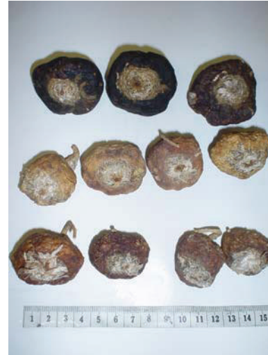
FIGURE 1: Dried hypocotyls of naturally dried black (upper), yellow (middle), and red (bottom) maca.

The principal and the edible part of the plant is a radish-like tuber that constitutes the hypocotyl and the root of the plant. This hypocotyl-root axis is 10–14 cm long and 3–5 cm wide and constitutes the storage organ storing a high content of water. After natural drying, the hypocotyls are dramatically reduced in size to about 2–8 cm in diameter (Figure 1). The average weight of the dried hypocotyls may