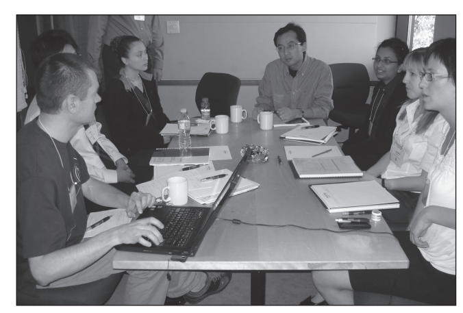
A group assignment at Research Topics in GI Disease IX, October 16 to 18, 2009, King City, Ontario