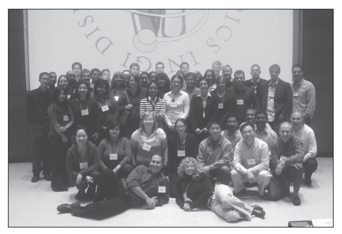
Research Topics in GI Disease VII, October 12 to 14, 2007, King City, Ontario