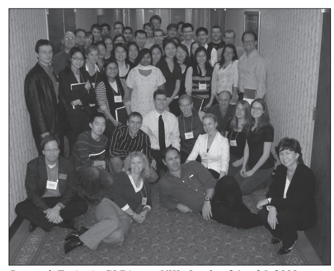
Research Topics in GI Disease VIII, October 24 to 26, 2008, Toronto, Ontario