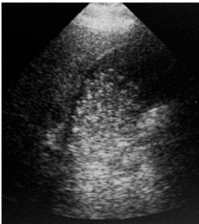
Fig. 2 - Ultrasound findings.