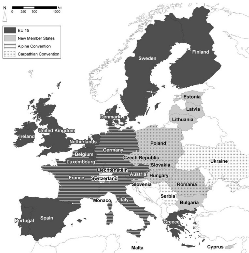
Fig. 1 Map of Europe indicating the members of the European Union (with a distinction of the New Member States that have acceded since 2004) and the contracting parties under the Alpine and Carpathian Convention

Germany is the first European country where data on the distribution and size of low-traffic areas have become available. The German Federal Agency for Nature Conservation conducted a first inventory of large areas not cut by major transport infrastructures (BfN 2008), whose data were used for the present study (Federal Agency for Nature Conservation, technical data on Natura 2000 from 2008, unpublished). These low-traffic areas were defined as larger than 100 km 2 and not dissected by roads with more than 1000 vehicles per day, by railway lines (twin-track and single-track electrified lines) or by human settlements, airports or channels (with the status of a Category IV Federal waterway or above). These criteria are generally applied in Europe (e.g., Andel and others 2005; Jaeger and others 2007; BfN 2008). Although further research to identify threshold values for traffic volumes are needed, the value of 1000 vehicles per day seems to be an acceptable synthesis of the current ecological evidence and models