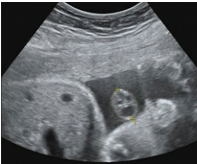
Figure 1: Transverse USG shows the method of measurement of the cross-sectional area of the umbilical cord (dotted circle)

Gestational age was based on a reliable last menstrual period or the earliest USG examination before 20 weeks of gestation. Routine pregnancy USG was performed in all cases and a normal amniotic fluid index was confirmed. Fetal anomaly was ruled out by an anatomic survey. Then, umbilical cord thickness, cross-sectional area, and coiling index were measured in a free-floating loop of umbilical cord using the software in the USG unit [Figure 1]. All USG